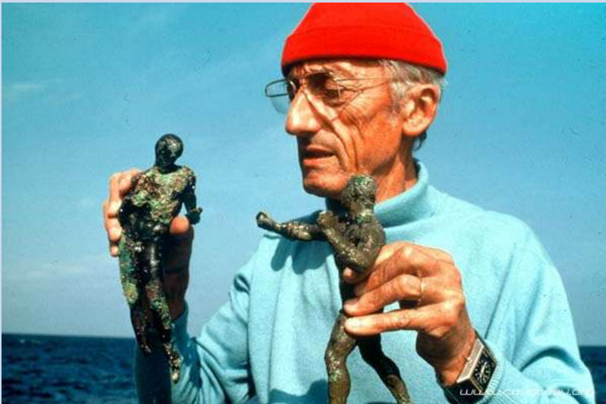
What a great Gallic symbol, that nose - c'est magnifique!