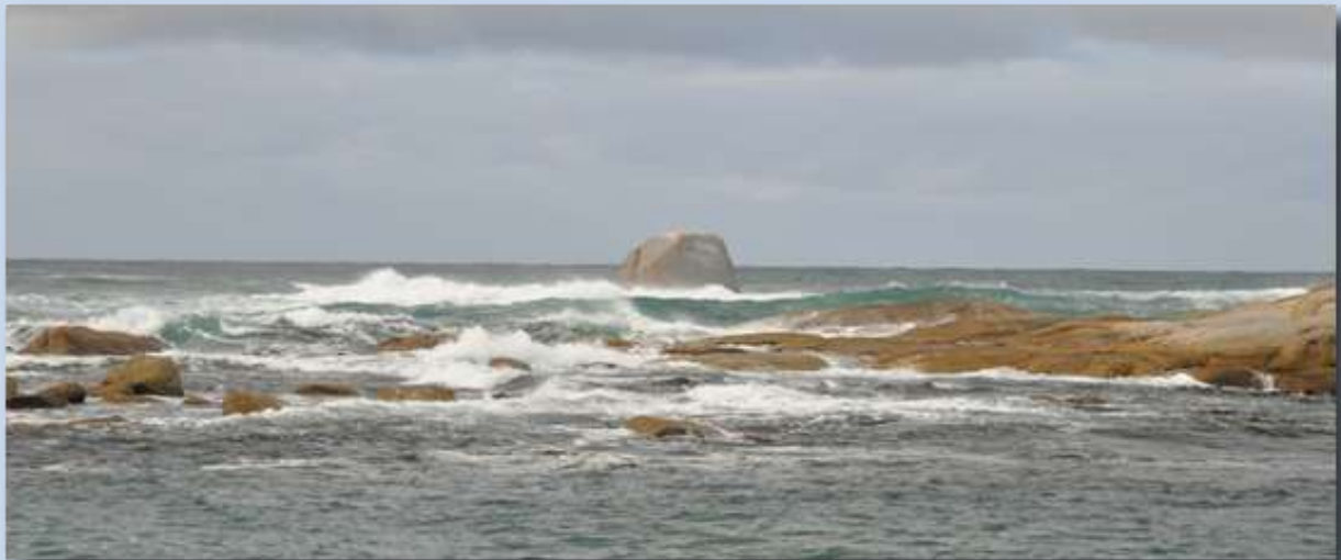
South-easterly swells hammered Governor Island in the days leading up to the event.

A large 4m swell rocked the Tasmanian east coast in the days leading up to the event which dramatically reduced the visibility. However, fine weather and calm conditions throughout the weekend saw the vis substantially increase over the three days resulting in some fantastic diving, particularly on the Monday. Divers hit a number of the top sites throughout the weekend including The Castle, Hairy Wall, Trap Reef, Canyon, Blue Waters, Split Rock, Muirs Reef, Bird Rock, The Steps and the Chimney.