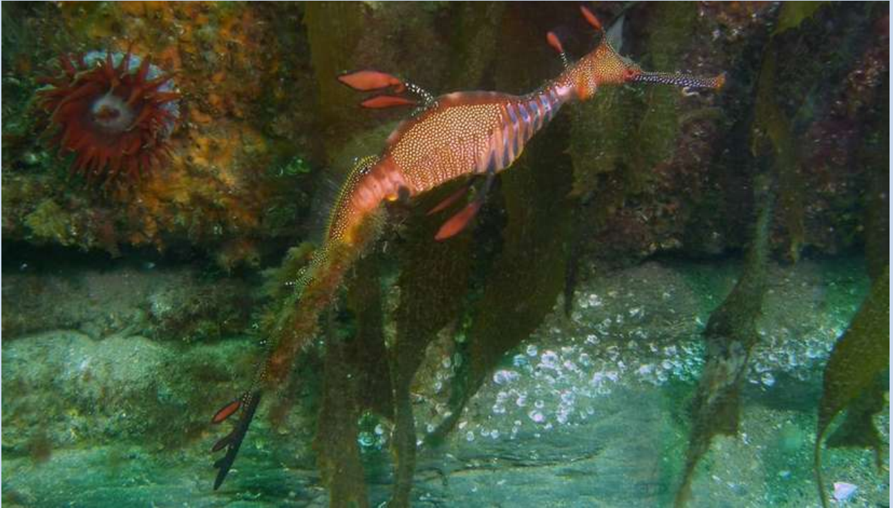
Male weedy seadragon carrying eggs camouflaged with an algal coating

The verdict of Keith's research is that the slow-paced lifestyle of weedies makes them vulnerable to sudden changes in their environment. "New seadragons only rarely appeared during the study, and this may mean it will take them a long time to recolonise an area if they are killed or the habitat is lost.", he said. So next time you're thinking of stealing a dragon or two for your nephew's aquarium, or tearing up that pesky seaweed that's getting in the way of the perfect shot, realise that the world of weedies is a fragile one. Why not dig out some seadragon snaps taken on your favourite reef and check out the spot patterning of your weedy subjects. You never know - you might just have your very own long-term stalking portfolio.